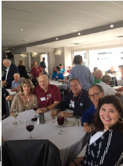
The Hornblower provided the venue for the Host Reception in CA (below).