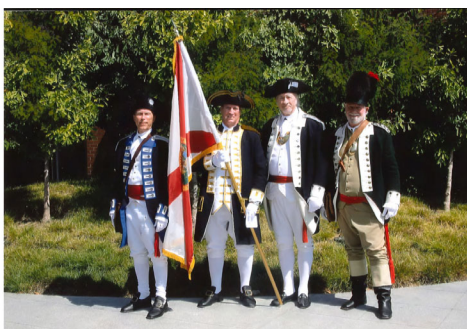
Color Guard members from the Florida continent (above).