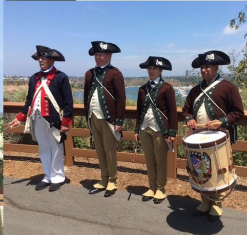
Drummer and Fifers accompany the NSSAR Color Guard.