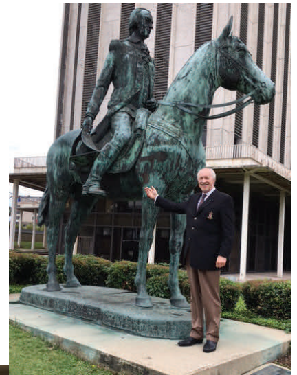
2017 BOM (below)