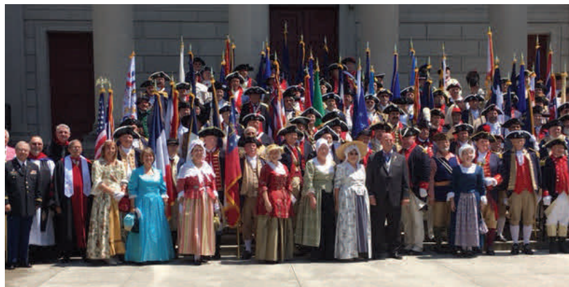
The 127th National Congress was convened in Knoxville, Tennessee.