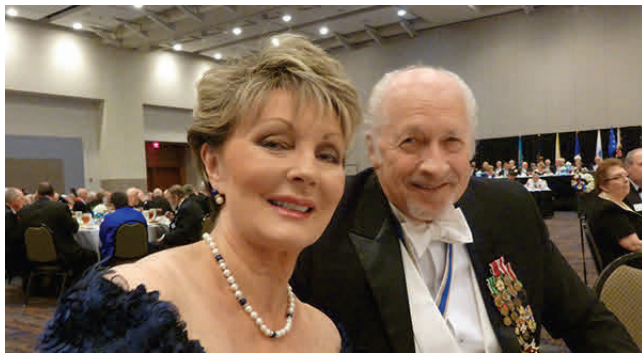
127th NSSAR Congress