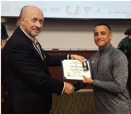
R.O.T.C. Decoration Presentation