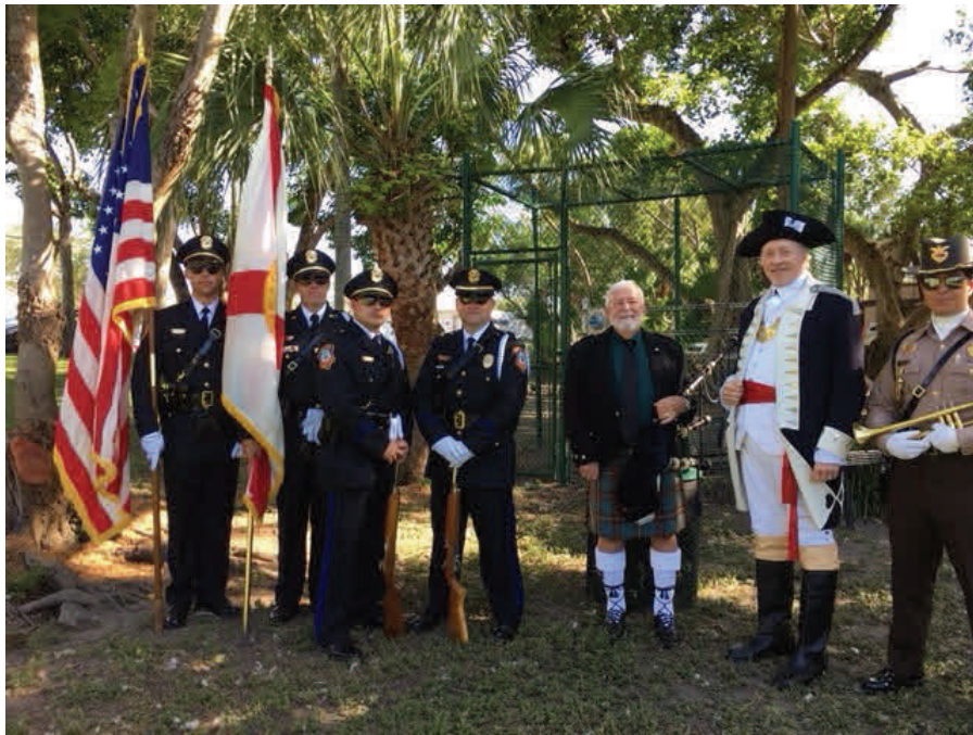
Dedication of the Blue Star Highway Marker