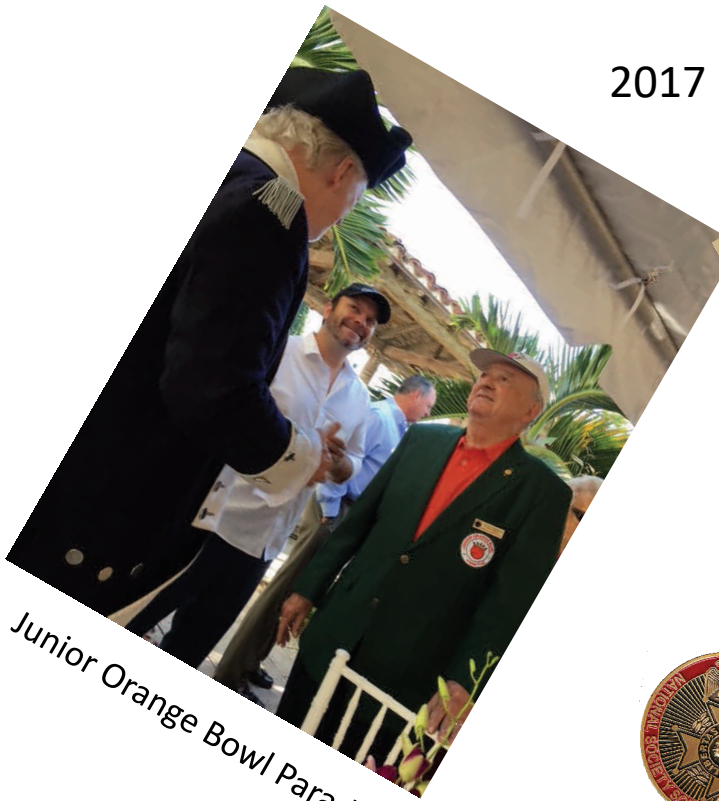
Junior Orange Bowl Parade