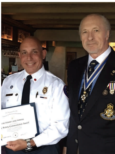
Awards & Decorations