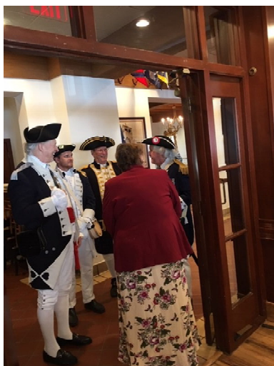
At left, the Color Guard is engaged in conversation with a DAR member prior to the flag presentation.