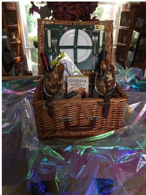
The Miami SAR submission to the array of gift baskets donated to the Fall BOM.