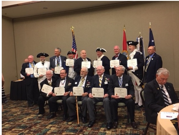
2018-2019 Regional Vice Presidents sworn into office during the Annual Spring BOM and Business Meeting.