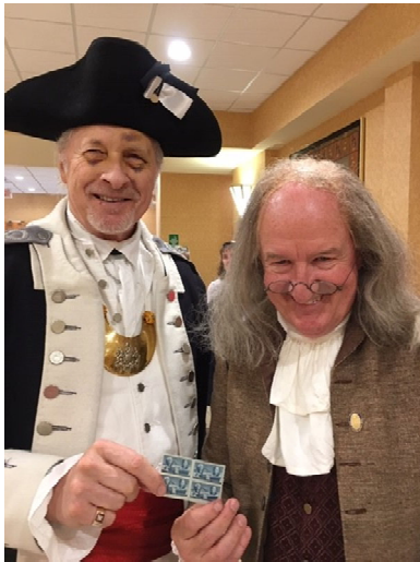
Military Lounge Benefit at Mercedes-Benz

Benjamin Franklin and acquaintance holding only US postage stamp that features two of the Founding Fathers.