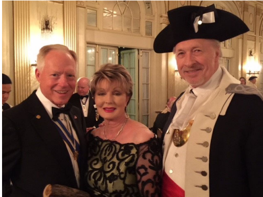
Springbom annual meeting