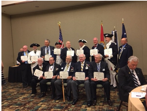
2018-2019 Regional Vice Presidents sworn into office during the Annual Spring BOM and Business Meeting.