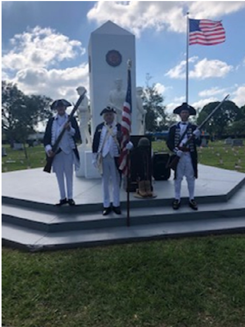
The Thomas Paine Camp presents the Colors at the dedication obelisk at the cemetery.